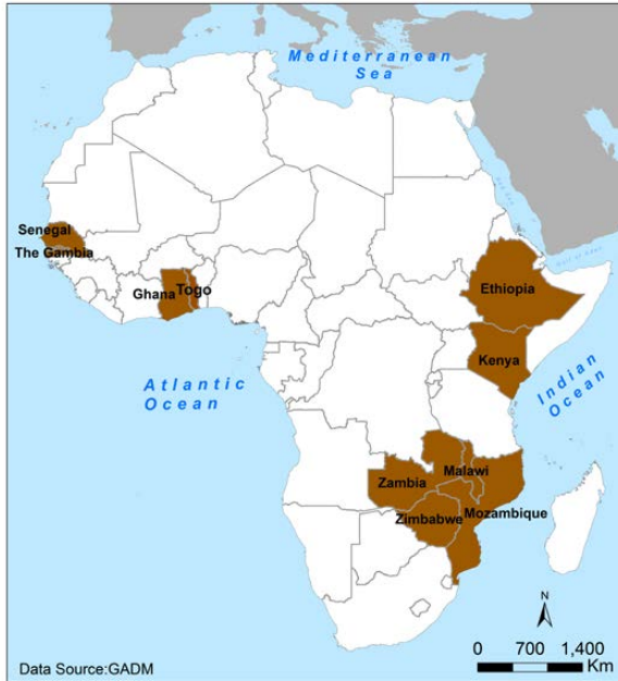
Figure 2. Ten African Country Case Studies

predicated on disaster risk but nevertheless form the backbone of a country’s ability to cope in the event of a disaster. An understanding of relevant spending in these areas must often be estimated through imprecise information from state and non-state actors involved in disaster-related activities.