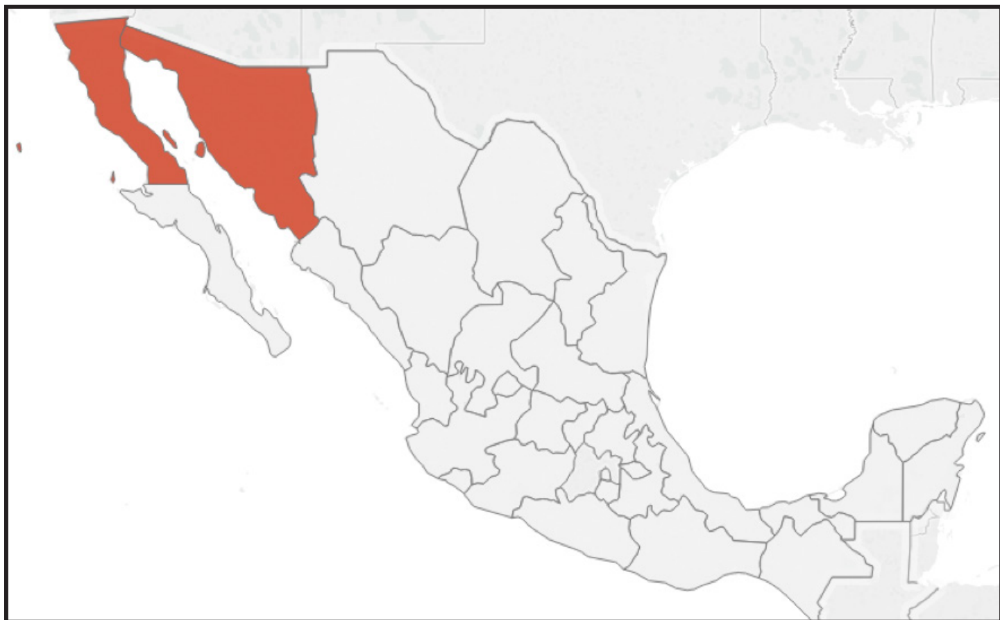
Map 4: Mexico's Northwest Border Region