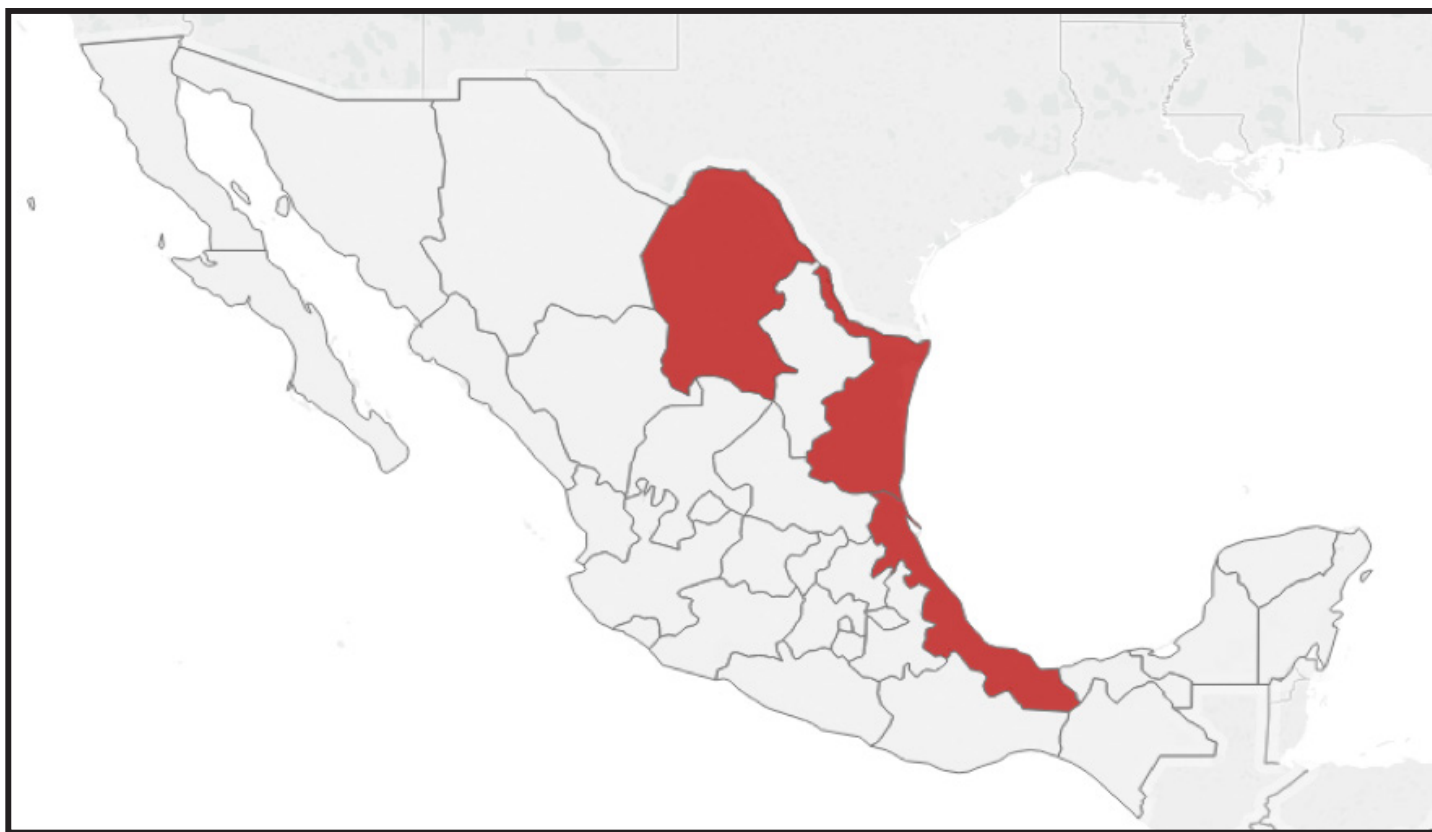
Map 3: Mexico's Northeast Border Region