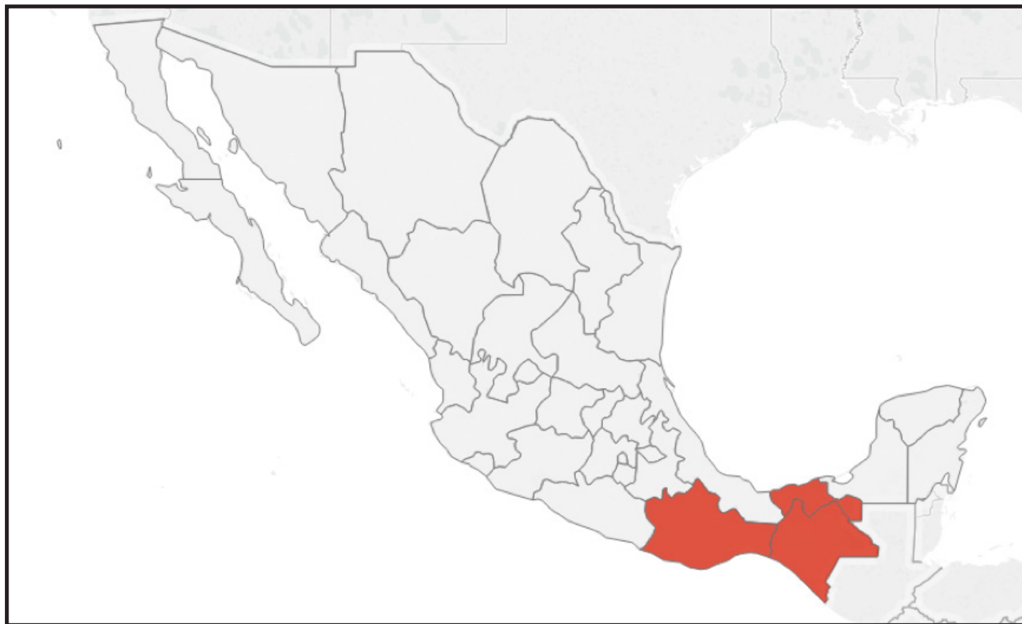
Map 2: Mexico's Southern Border