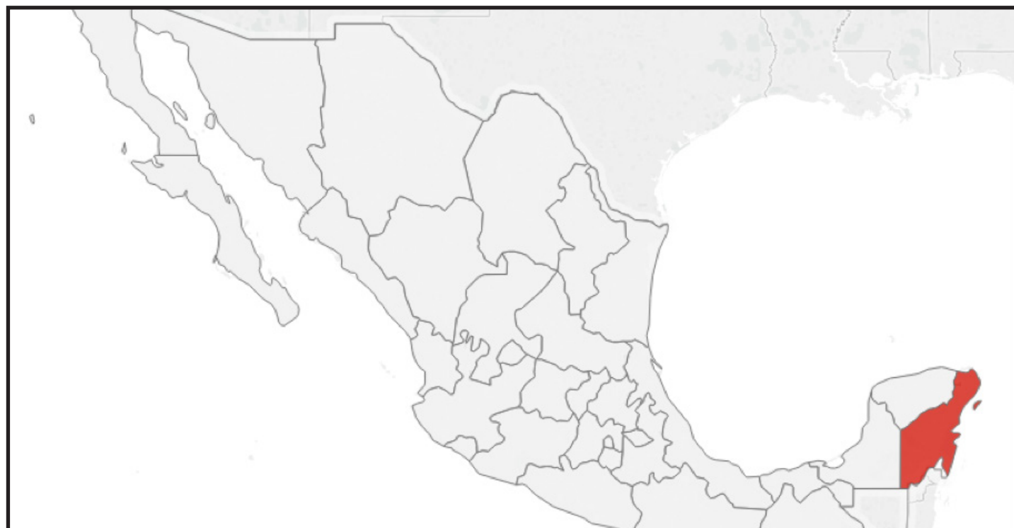
Map 5: Mexico's Yucatán Peninsula