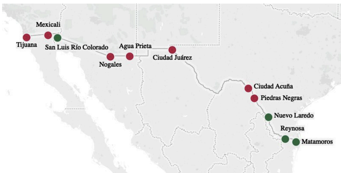
Figure 2: Mexican Border Cities By List Status

Data collected from April 1, 2020 to April 6, 2020.