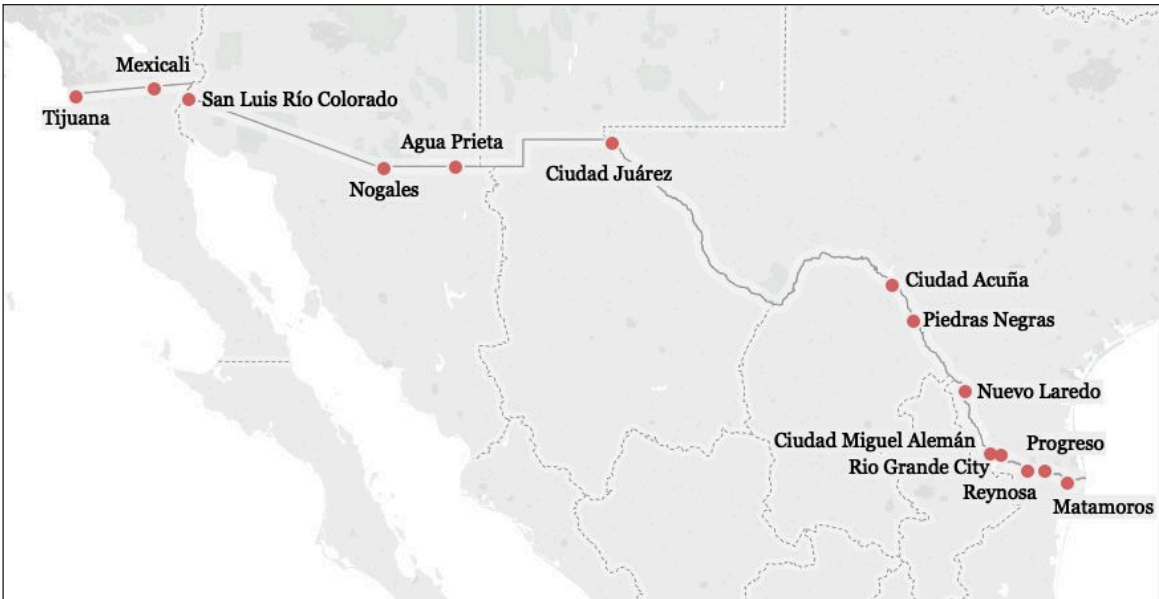
Figure 2: Mexican Border Cities Covered in the August 2019 Asylum Waitlist Update